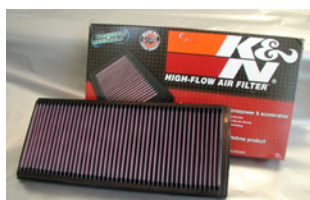
K&N High Flow Air Filter for Roadsters. £75.64 inc.