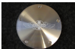
Morgan Engraved Tax Disc Holder £21.00 inc.