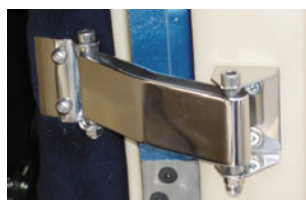
Door Check Strap £130.80 inc per set