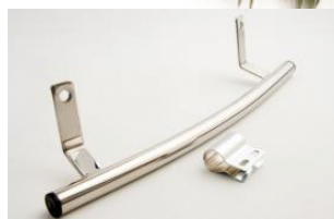
Badge Bar £39.90 inc. Clips £6.42 inc