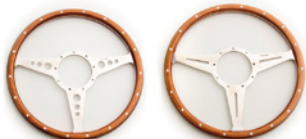
Moto-Lita Steering Wheel Round or slotted holes. £143.70 inc.