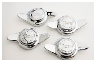
Hub Spinners £40.82 inc. each