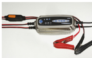
CTEK Battery Conditioner/Charger £57.95 inc.