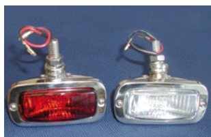
Reverse and Fog Lights £32.88 inc. each